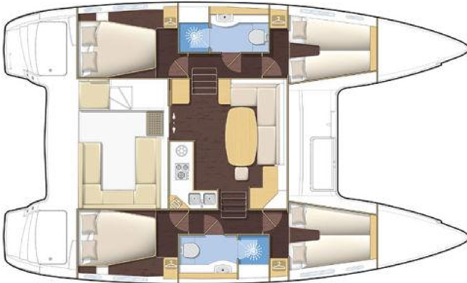
4 cabines 2SDB et renommer "Plan version 4 cabines 2 SDB"/ 4 cabins version - 2 washrooms