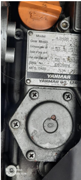
que du bonheur. 26 août 2024 12:28