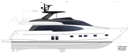
Profilo esterno Right profile RT optional