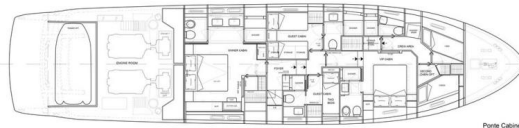
Ponte Cabine Lower deck