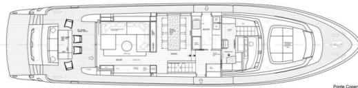
Ponte Coperta Main deck